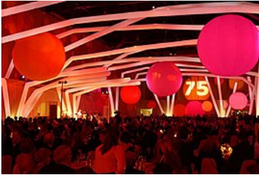
Art Center event at the Wind Tunnel