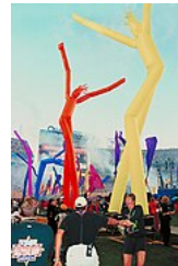
Fly Guy 98 Super Bowl