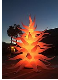
Opening of Epic Media studios