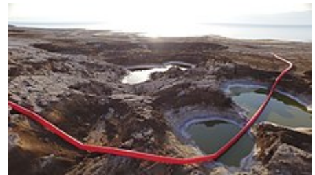
The Red Line Project (Dead Sea Sinkholes)

Gazit's Red Line Project has been installed in the sinkholes of the Dead Sea in Israel, melting Knik Glaciar in Alaska, the Great Salt Lake in Utah, and the Salton Sea in California. He has planned future installations along the Amazon river , the forests of the Sumatra and Borneo , and the floating islands of garbage in the oceans . [2]