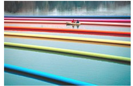
On the Asahi river, Okayama, Japan

Air Dimensional Design was founded by Doron Gazit. Gazit was invited to decorate nine different venues for the 1984 Olympic Games in Los Angeles. He used polyethylene AirTubes as temporary architecture which Gazit calls AirChitecture. [5][6] Gazit is credited as a co-inventor of the dancing inflatable which was developed for the 1996 Olympic Games in Atlanta. [7][8]