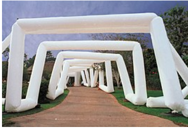
Tunnel of arched Airtubes