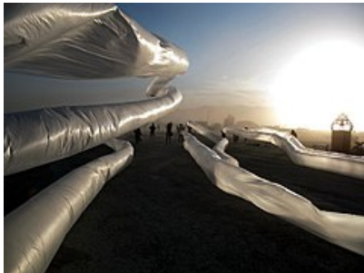
Sculpting the Wind at sunset