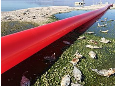
Red Line at the Salton Sea