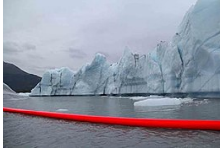
Red Line at the melting glaciers of AK