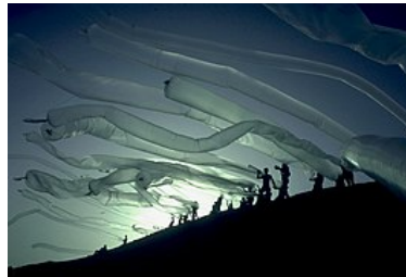
Sculpting the Wind